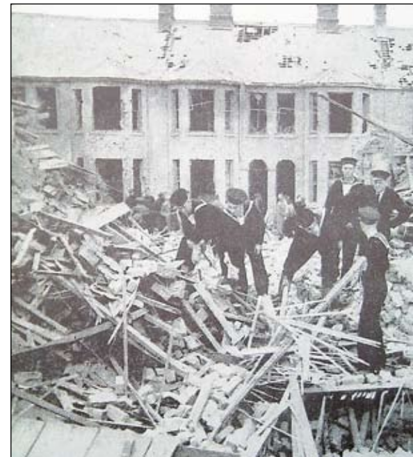
As it was: sailors from the town's naval base help clear the wreckage around the junction of St Leonard's Road and Lorne Park Road after the bomb incident 70 years ago.