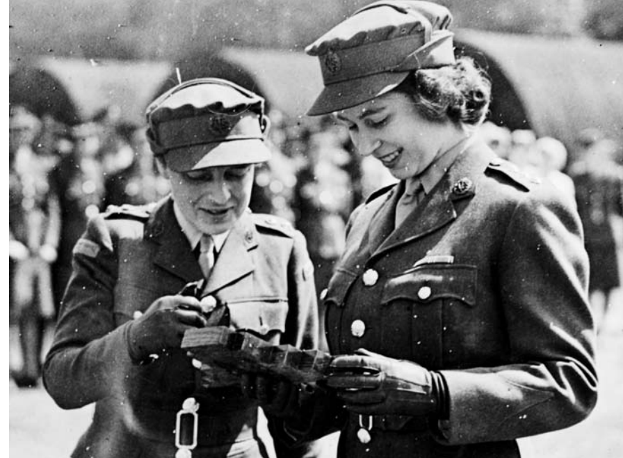
Royal visit: Princess Elizabeth at Irene Warren's ATS camp.